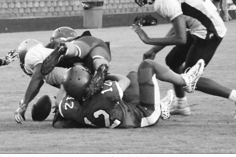
The Indians defense forces a turnover during the first half of last Friday night's scrimmage contest with Class AA's Butler High School from Augusta.

the Yellow Jackets came in 2009 by a score of 48-12. However, the two schools haven't met in the regular season since 2013 - a 20-0 Hayesville victory.