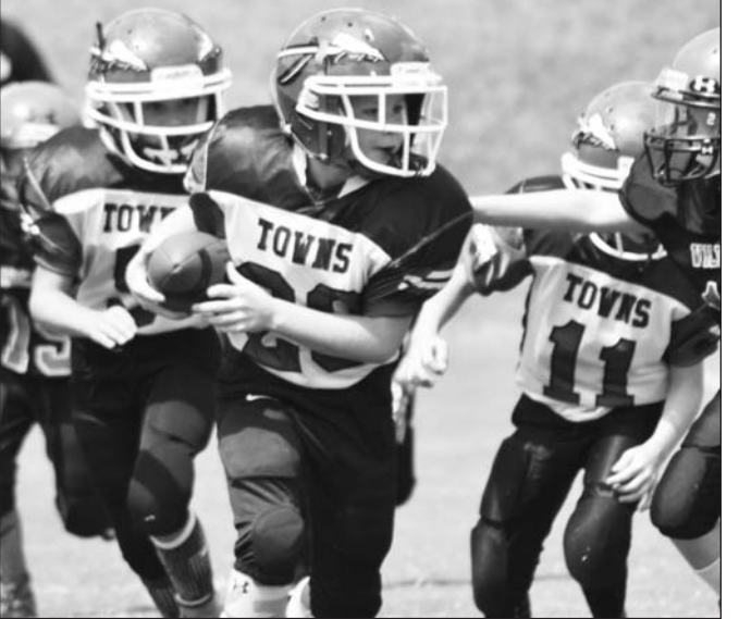
Towns County Herald Sports Special

Towns County Youth Football opened its 2016 season at its new stadium at the Towns County Recreation Department by hosting the Andrews Wildcats for four games last Saturday.